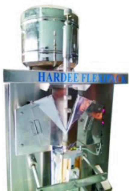
Liquid Pouch Packing Machine