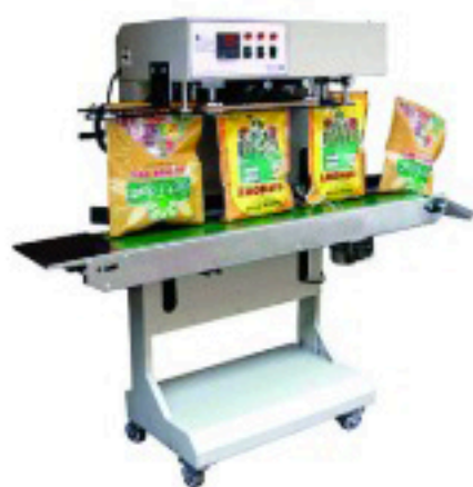
Heavy Duty Sealer