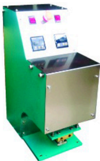
Manual Valve Applicator