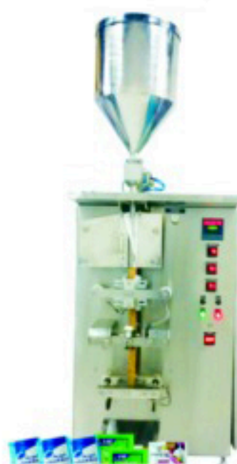
Mini Pouch Packing Machine