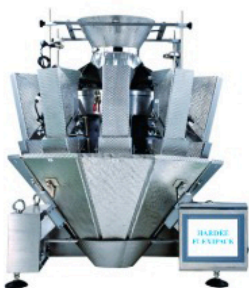
Multi Head Weigher