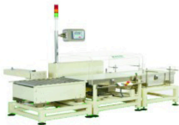
Online Check Weigher