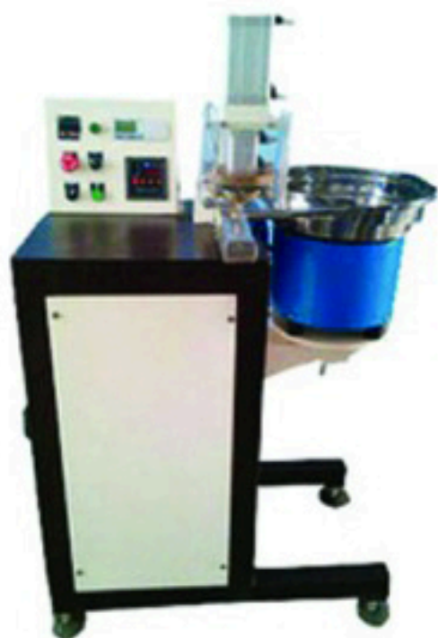
Semi Automatic Valve Applicator