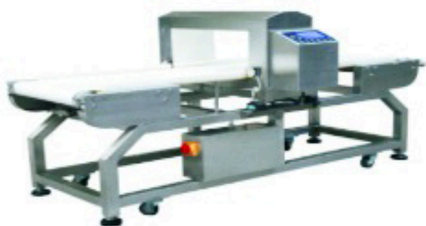
Online Metal Detector