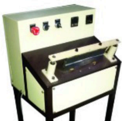
Manual Zig Zag Sealer